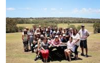
Staff and partners enjoying a great day out