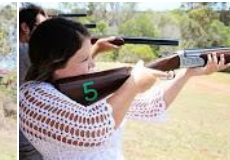
Our own Annie Oaklies. Go girls